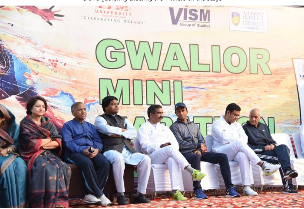
Dignitaries on the dais