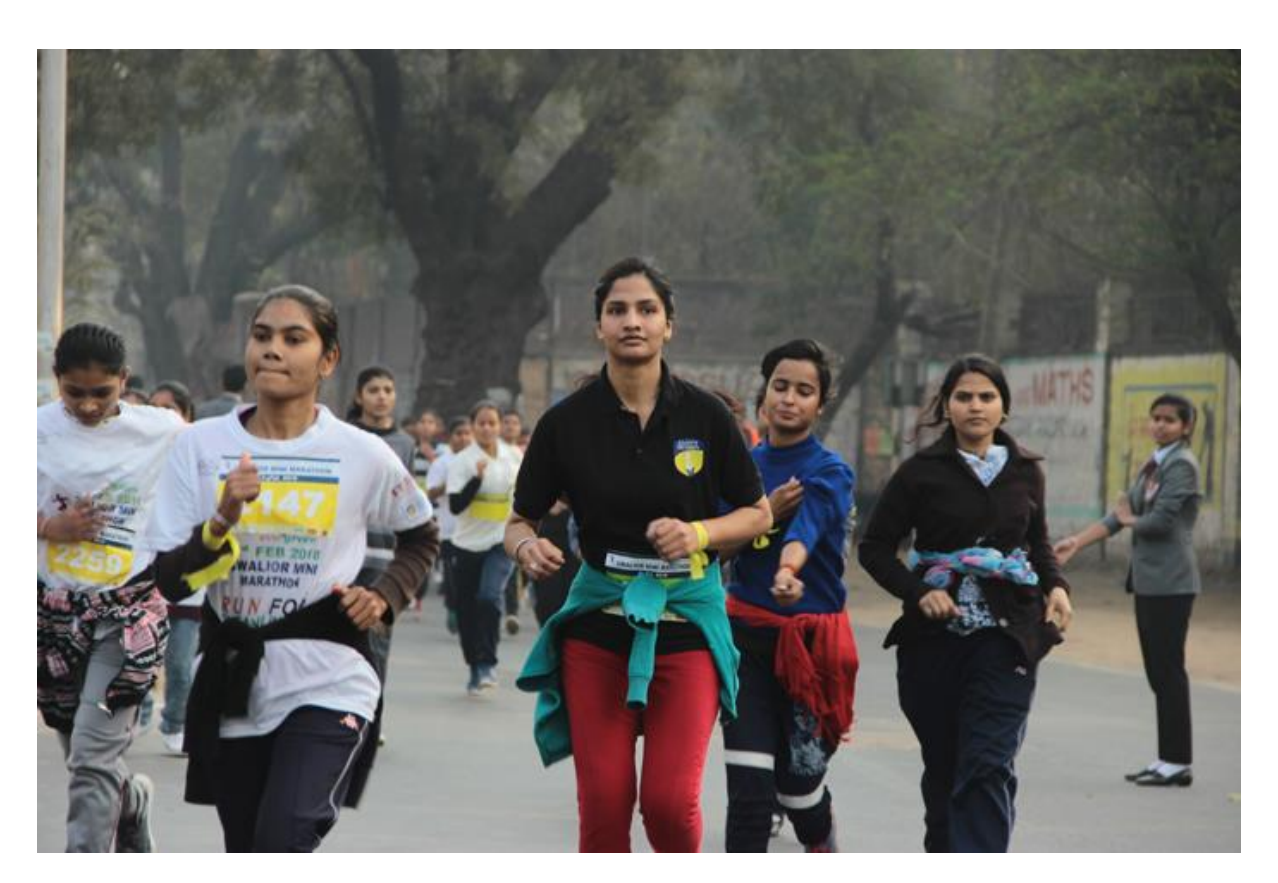
Participants students and staff from Amity University Madhya Pradesh, Gwalior