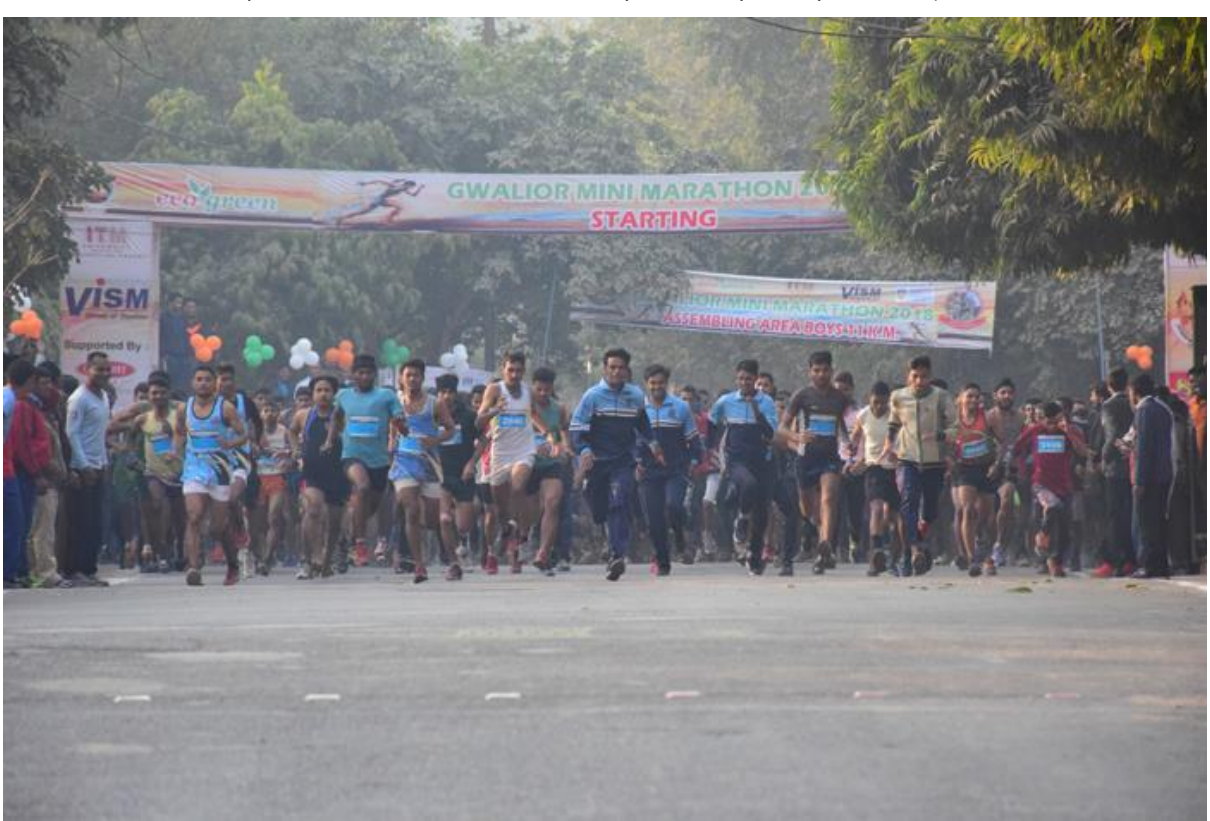
Runners at the start of the Merathan