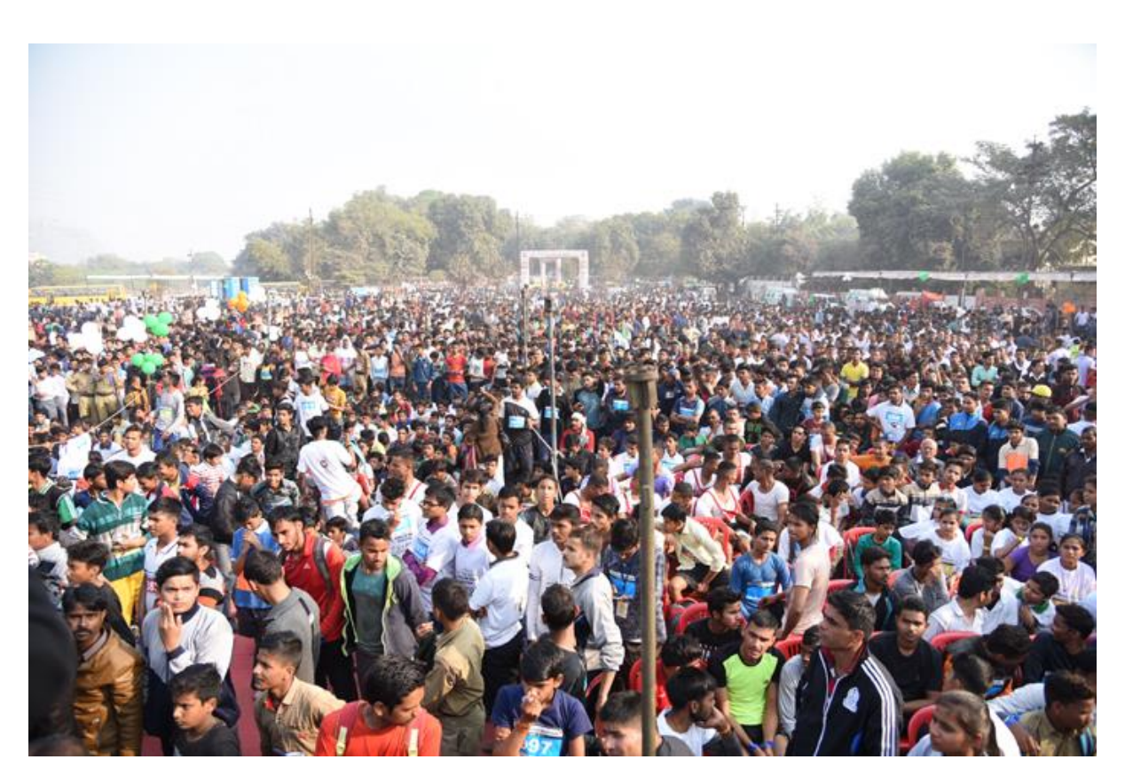
Crowd gathering cheering the winners on the stage