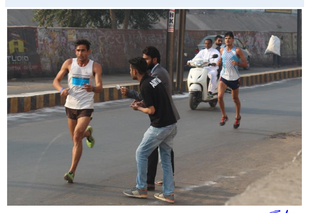
Volunteers from AUMP helping the runners

The event was a great success and around 4000+ citizens of different age groups and categories, Children, Females, Youth & Senior Citizens participated with zeal and enthusiasm.